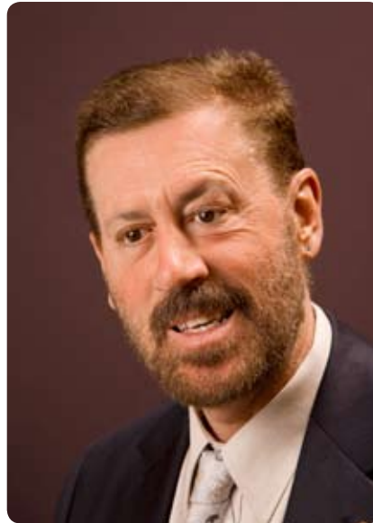
Graeme Innes AM

Human Rights Commissioner and Disability Discrimination Commissioner