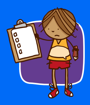
too many rules to get in