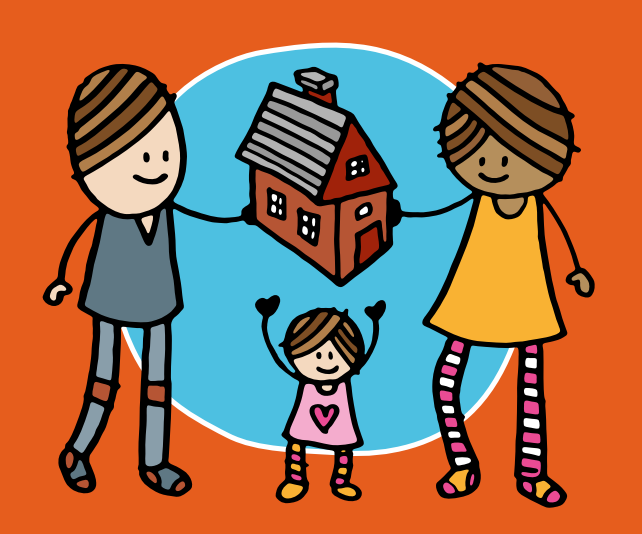
help with housing

The top three things you and parents said would help keep you safe were: