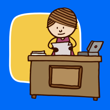
staff who didn't understand them