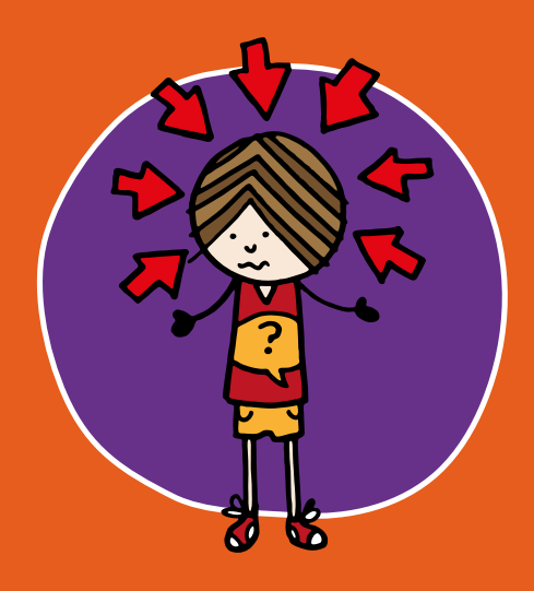
mental health services