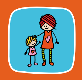
worried about children being taken away