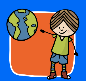
no services nearby