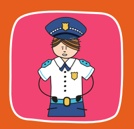
not feeling like the police will understand

You said that there were lots of reasons why it can be difficult to get help when there is violence in your home, including: