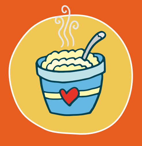
help with basic